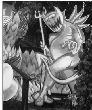
The devil was a real trooper! The morning after revealed him still on his feet, as happy as a god damn clam!

through most of the night, and then, spitting wet electricity, quickly ground to an ignominious stop.