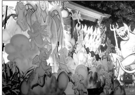
Just before the deluge! The Eternal Battle Between Good and Evil is being waged. Both sides have a pre-recorded soundtrack dispensing good and bad advice to the Trick or Treaters.

the rain. I wait out the whole rest of the year for the Winter. But, C'mon Dude!