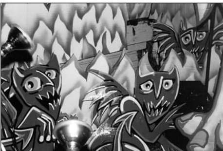
Why so scared? It's just a little rain!

that Halloween was about to tuck its tail between its legs and run yelping down the road. I was running around like a water-logged chicken head shaking my fists in frustration at the heavens as the first celestial urination of the year took place directly on and in my mental commode. In other words, it started to rain for the first time that year on Halloween, a year when the weather pundits were predicting another drought. Well, let me just say that I love