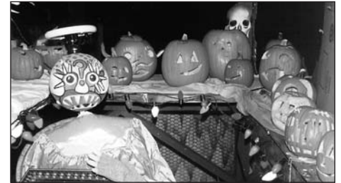
The many faces of Cob. It spun around, and when strobed, appeared to be a floating apparition who couldn't decide whether to laugh or cry, be surprised or bored! I received a bad electric shock trying to keep this thing going all night.